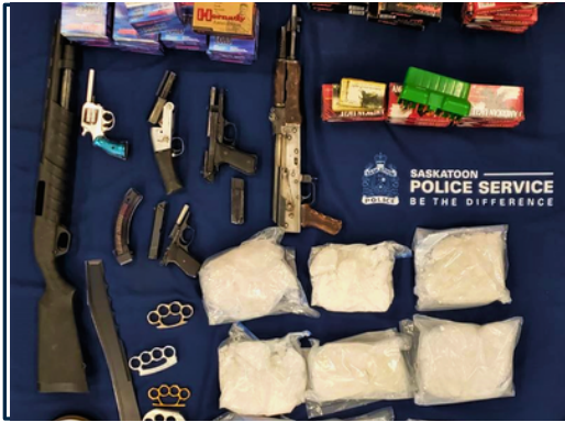
Street gang tools

Every parent should be aware of the behaviours and characteristics associated with youth and criminal street gang involvement. Pictured above are just some of the weapons and tools used by gang members on the streets of Saskatoon. A Criminal Organization is defined as a group comprised of 3 or more persons, that has as one of its main purposes or activities the facilitation or commission of one or more serious offences, which if committed would result in and be a benefit to the group or any persons who constitute the group.