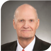
Commissioner Kearney Healy