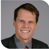
Mayor Charlie Clark