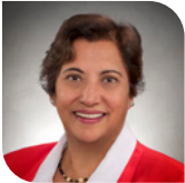
Commissioner Jo Custead